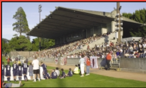
A GRAND AFFAIR: Royal Athletic Park, Victoria, was jam-packed an hour before kick-off