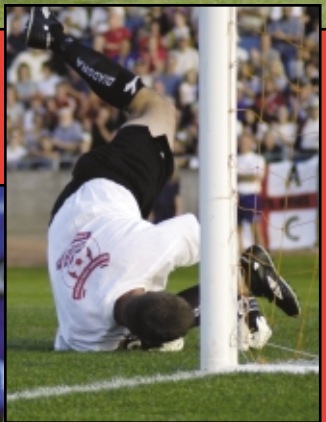
100% EFFORT: BC's keepers spared no expense in duty